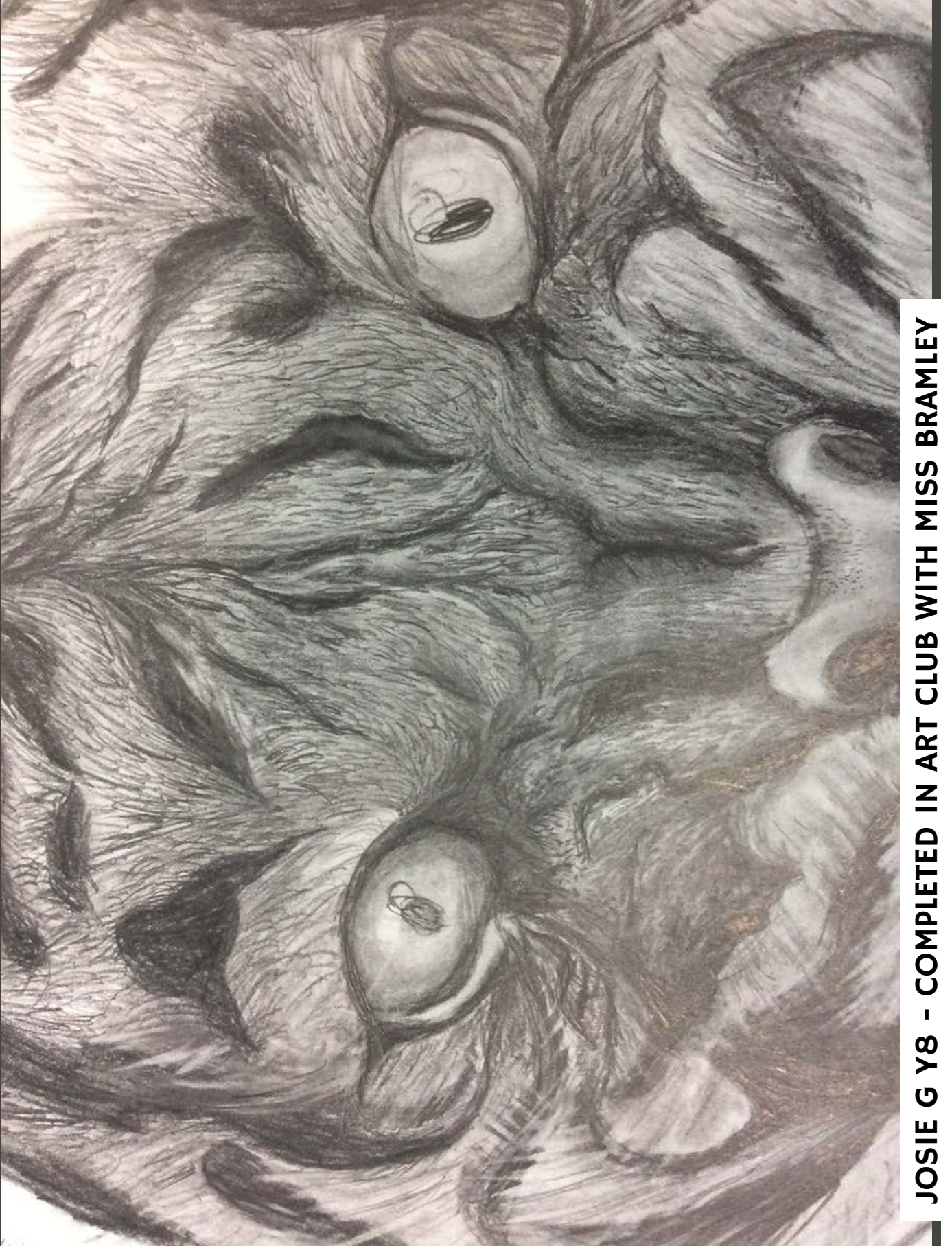
JOSIE G Y8 - COMPLETED IN ART CLUB WITH MISS BRAMLEY