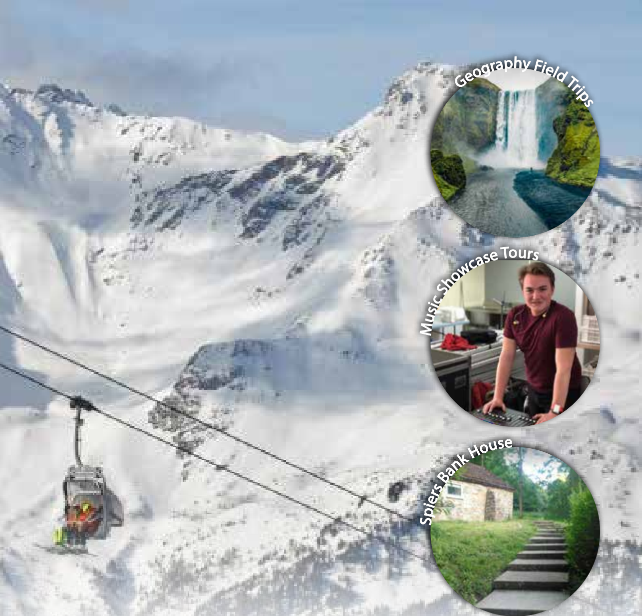
Geography Field Trips